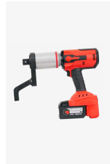
Acceptance Number PA05/05265