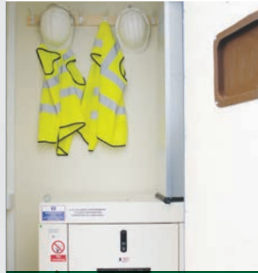
Warm room / Generator area