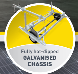
Fully hot-dipped GALVANISED CHASSIS