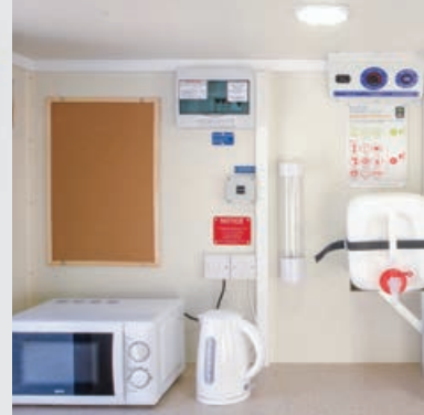
Well equipped canteen